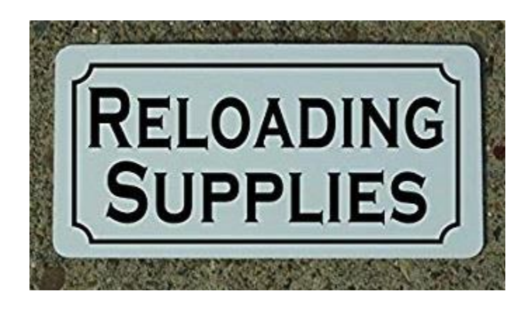
Part 1: Reloading for Retards - Buying the Stuff

As I've mentioned in recent weeks, reloading can be a fun and rewarding hobby unto itself, as well as providing a shooter with high quality ammunition when commercially made ammo is unavailable. This week, we'll cover the basic equipment and tools necessary, and their function. In later weeks we'll discuss how to set it all up and use it to produce ammunition.