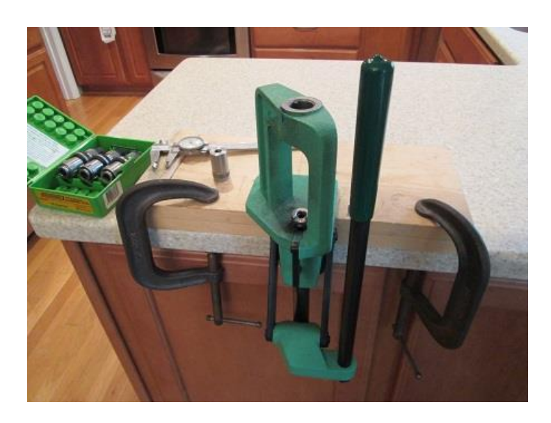
Press setup on kitchen counter