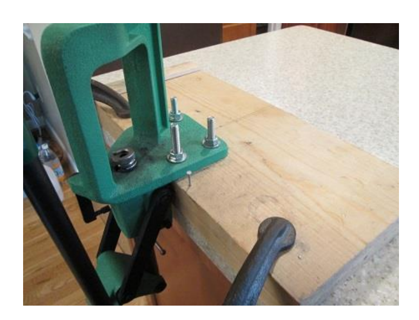
Press setup alt view - note bolts