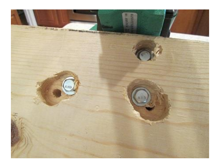
Countersunk holes on bottom of base

Your press is the primary tool on your bench. I'm right-handed so I have my press on the right side of the workspace. The press is just that; a device with a mechanical ram that moves up and down when the handle is pulled. It doesn't do much by itself without reloading dies, which screw into the top of the press and perform different functions. Brass cartridge cases are shaped and resized under pressure produced by the ram and die, and in order to achieve the necessary small tolerances they need to be setup carefully. You will check the die function with precision measuring tools such as the calipers and case gauge included on last week's shopping list.